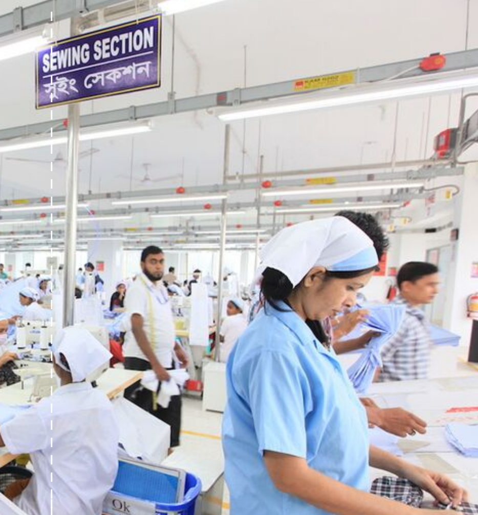
Fig Leaf for Fashion

How social auditing protects brands and fails workers