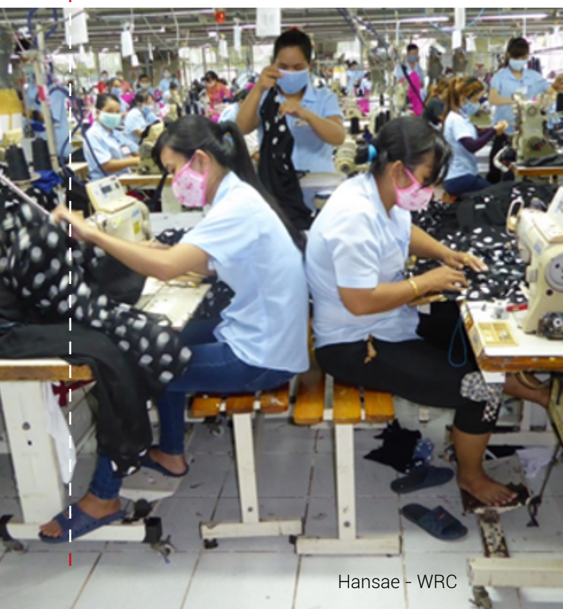
Hansae - WRC

Top Glove, Malaysia (2017-2018): A range of labour and human rights abuses were uncovered in rubber glove manufacturer Top Glove’s 40 factories, including forced labour, debt bondage, excessive overtime, exorbitant recruitment fees, and the systematic confiscation of passports from migrant workers. Nonetheless, the factory was audited and certified by firms and programmes including UL, Bureau Veritas, SGS, SA8000, and Amfori BSCI. Auditing firms and social compliance initiatives have not suffered long-term effects from these failures, but instead continue to be profitable multi-billion dollar companies.